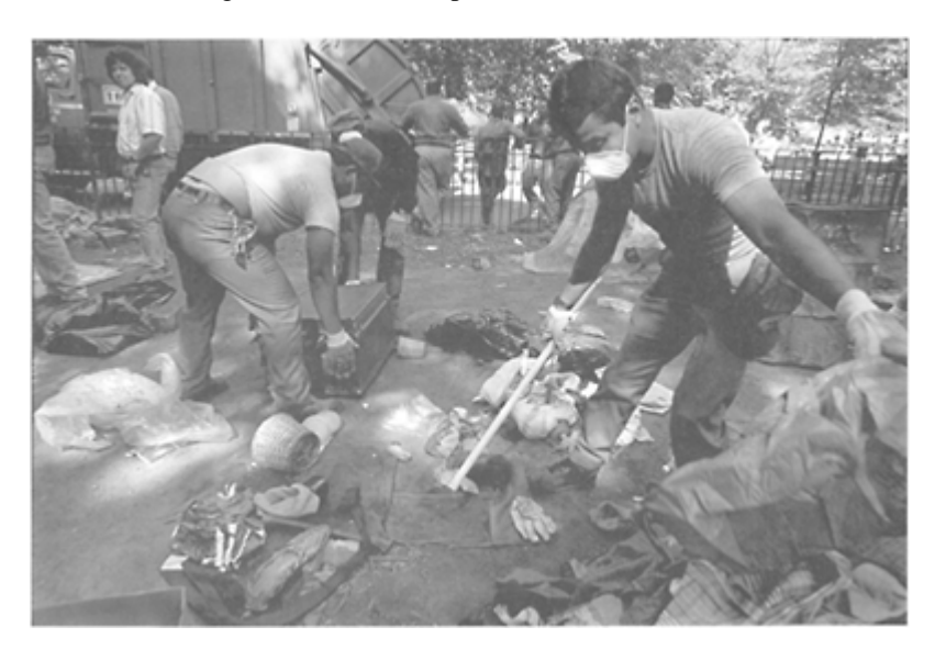
Plate 1.2 The closing of Tompkins Square Park, June 3, 1991

As the site of the most militant antigentrification struggle in the United States (but see Mitchell 1995a), the ten acres of Tompkins Square Park quickly became a symbol of a new urbanism being etched on the urban "frontier." Largely abandoned to the working class amid postwar suburban expansion, relinquished to the poor and unemployed as reservations for racial and ethnic minorities, the terrain of the inner city is suddenly valuable again, perversely profitable. This new urbanism embodies a widespread and drastic repolarization of the city along political, economic, cultural and geographical lines since the 1970s, and is integral with larger global shifts. Systematic gentrification since the 1960s and 1970s is simultaneously a response and contributor to a series of wider global transformations: global economic expansion in the