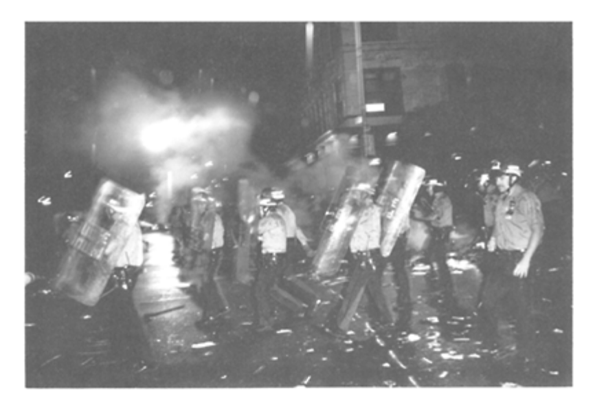
Plate 1.1 New York City police retake Avenue A on the edge of Tompkins Square Park. 1988