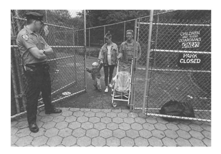
Plate 1.3 Tompkins Square Park fenced off, 1992

1980s; the restructuring of national and urban economies in advanced capitalist countries toward services, recreation and consumption; and the emergence of a global hierarchy of world, national and regional cities (Sassen 1991). These shifts have propelled gentrification from a comparatively marginal preoccupation in a certain niche of the real estate industry to the cutting edge of urban change.