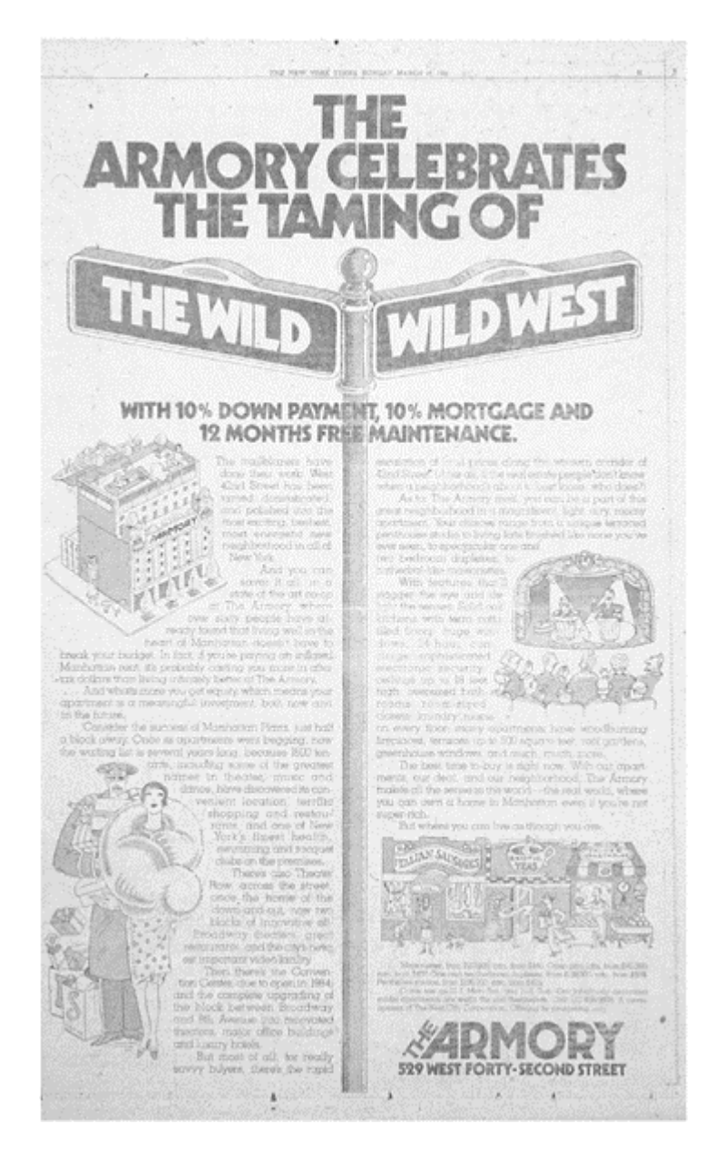
Plate 1.4 Real estate capital rides the new urban frontier

always so. The analogy between the 1874 Tompkins Square marchers and the Sioux Nation was at best tentative and oblique, the mythology too young to bear the full ideological weight of uniting such obviously disparate worlds. But the real and